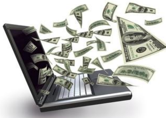
This tax season CAP prepared over 1/2 million in tax returns!

They were honored during the - VOLUNTEER APPRECIATION LUNCHEON held at the Fine Arts Museum in St. Petersburg.